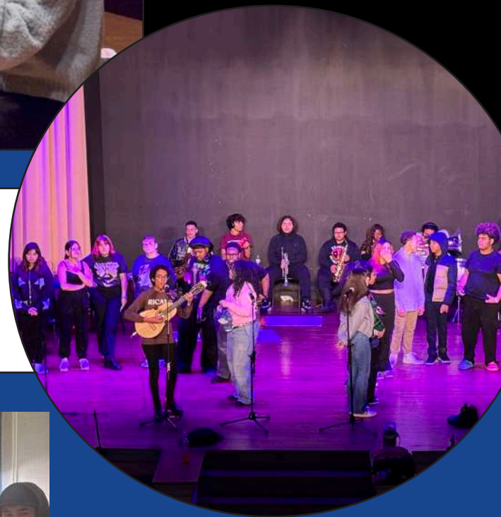
"It inspired me to look deeper into meanings behind music I perform" ~ Student