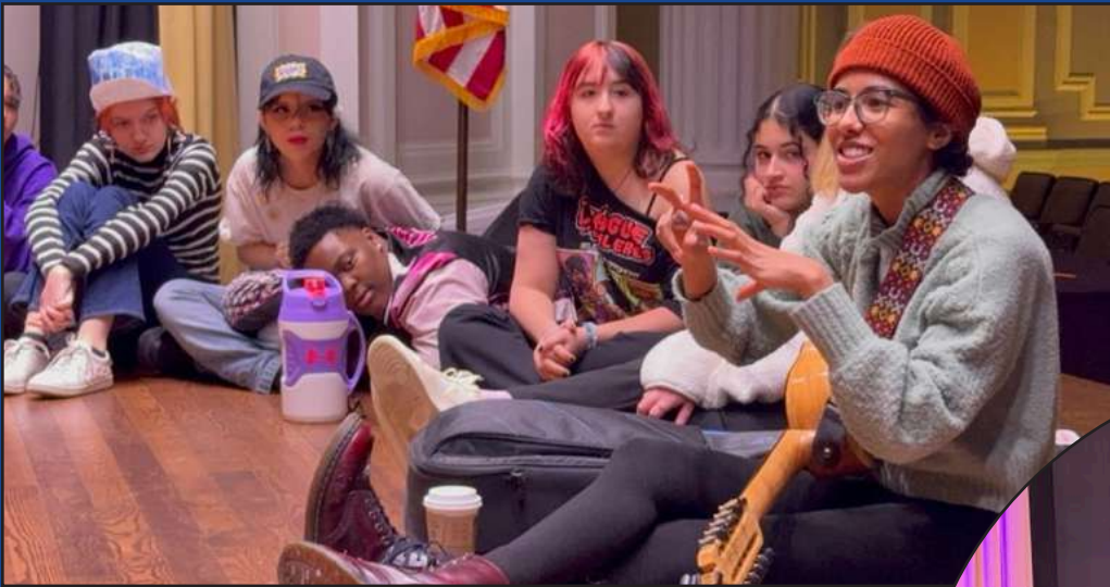
She really inspired me. ~ Student

"This was a once-in-a-lifetime opportunity for our students to learn from a master Hispanic artist. Her knowledge and musicianship were the highlights of the entire school year, and the impact on every student and faculty member from grades 6-12 was beyond words."